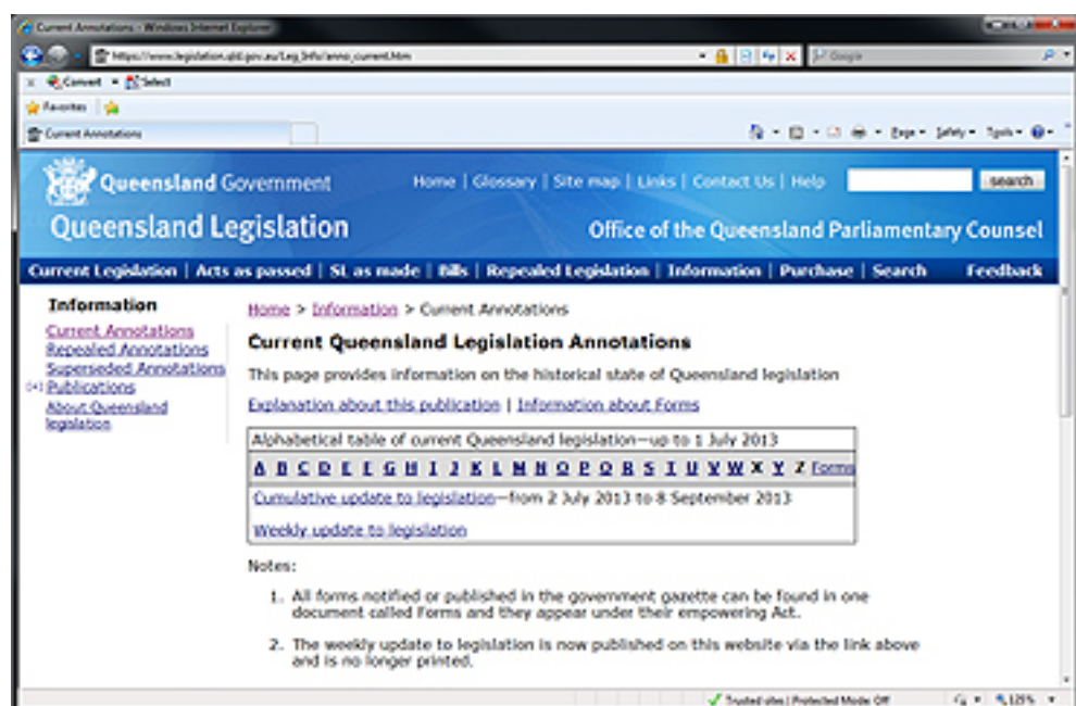
Screenshot of current Queensland legislation annotations page